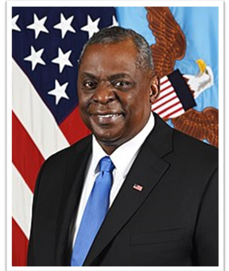
Secretary of Defense Lloyd Austin